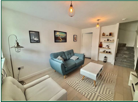
GROUND FLOOR 312 sq.ft. (29.0 sq.m.) approx.